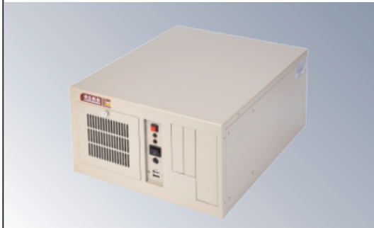
RK-608M1 Wall-mounted industrial case