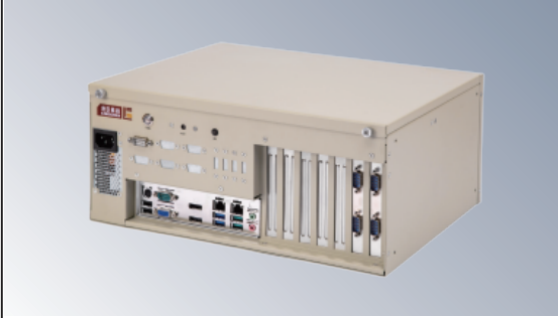
RK-607S Wall-mounted industrial case