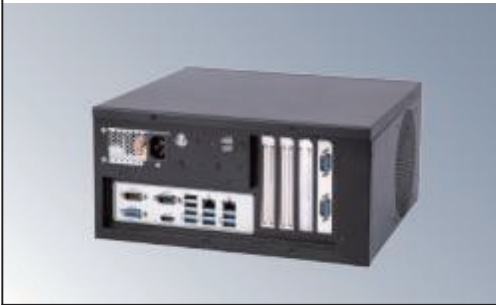
IBX-504C Wall-mounted industrial case